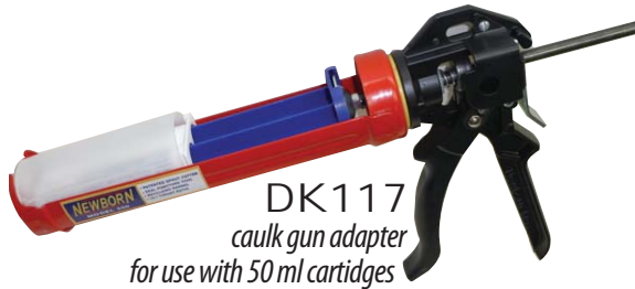
DK117 caulk gun adapter for use with 50 ml cartridges