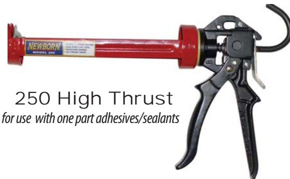
250 High Thrust for use with one part adhesives/sealants

Call for pricing and additional products