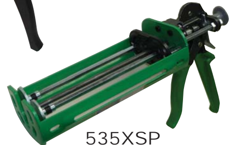
535XSP for the side by side 375 ml cartridges