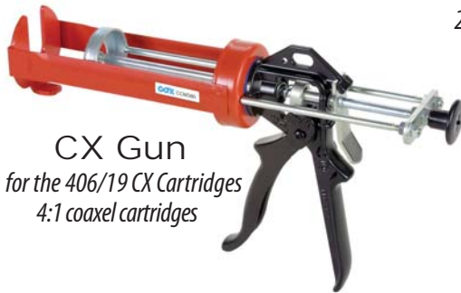
CX Gun for the 406/19 CX Cartridges 4:1 coaxel cartridges