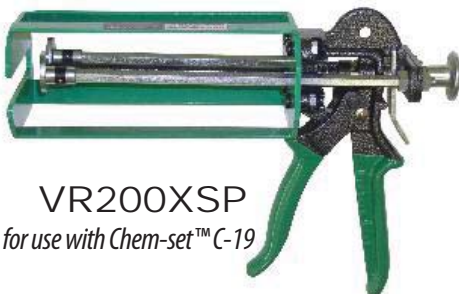
VR200XSP for use with Chem-set™ C-19