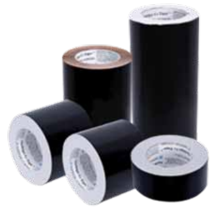
2", 4", 6", 9", 12" Black (3040BK) Permanent