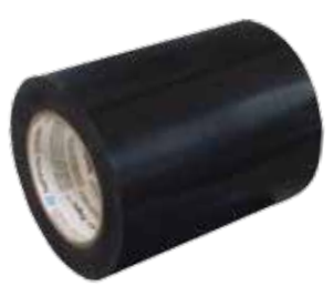
6" Black (BAB0650)