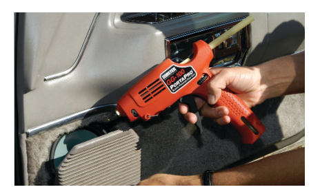
Cordless operation gives you the freedom to take the glue gun to the jobsite.