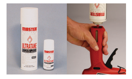
Powered by Master Ultratane butane