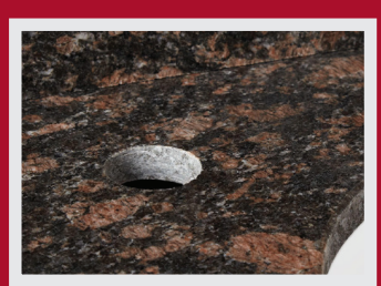
Panel and Ceiling Faucet Hole Drilling