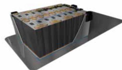
Prismatic Battery Pack