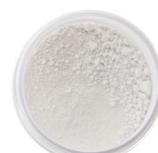
Last Patch Powdered Tint WHITE