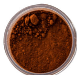
Last Patch Powdered Tint BROWN