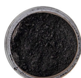
Last Patch Powdered Tint GRAY