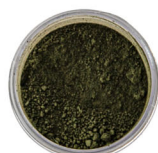
Last Patch Powdered Tint GREEN