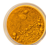
Last Patch Powdered Tint YELLOW