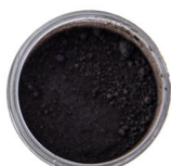
Last Patch Powdered Tint BLACK