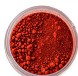
Last Patch Powdered Tint RUST