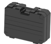
Optional (1001-1) Hard Plastic Carry Case for AT-Line Guns