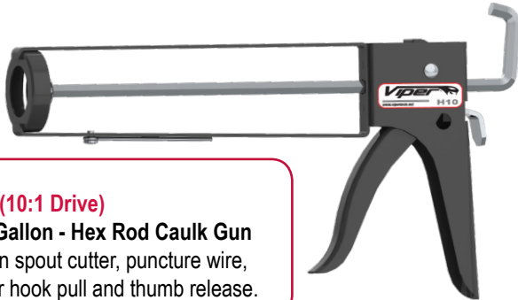
H10 (10:1 Drive) 1/10 Gallon - Hex Rod Caulk Gun Built-in spout cutter, puncture wire, ladder hook pull and thumb release.