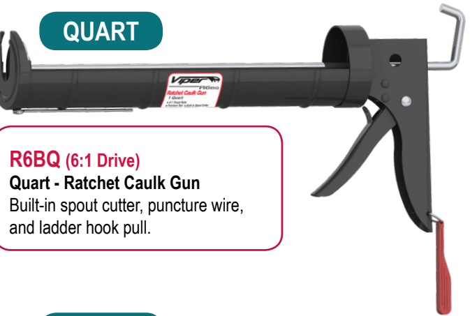
R6BQ (6:1 Drive) Quart - Ratchet Caulk Gun Built-in spout cutter, puncture wire, and ladder hook pull.